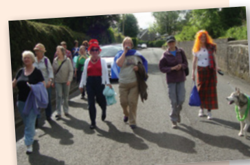
Slight shortage of saris and grass skirts, but never mind.

In case you wondered, the colourful characters sporting flags, hats and kilts (and yes a wig or two!) winding their way to Cowden Hall recently were the WEDNESDAY WALKERS on their Big Fit Commonwealth walk! Don't they look good? (normal attire tends to be of the anorak variety).