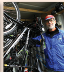
Can he fix it? Yes he can!