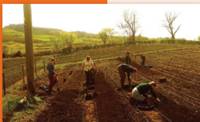
Volunteers at Locavore Market Garden

Locavore exists to take forward initiatives which contribute to the creation of sustainable local food economies. We're developing one hectare of farmland on the outskirts of Neilston into a productive market garden, which will supply fresh produce to our veg bag scheme, our shop in Nithsdale Road and other local markets. The Market Garden will function both as a productive garden supplying local organic food and supporting local community plots, volunteering, and wider outreach work in Neilston. Contact the Bank for more info and watch the Space for news of progress.