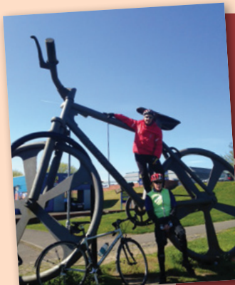
Cycling's getting bigger!

For full details of activities, training, and cycling news visit www.goneilston.co.uk , our new dedicated site.