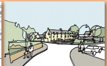
Housing opportunities in the village centre

8 Ensure that the historic importance of Cowden Hall is recognised and that it forms part of the SPG. Thus funding may be unlocked for a study, restoration and future development work in this historic garden.